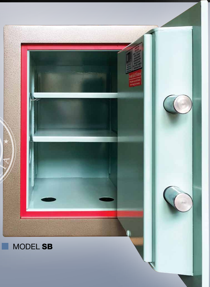
■ MODEL SB

HINGES: Fully adjustable anti-jacking hinges